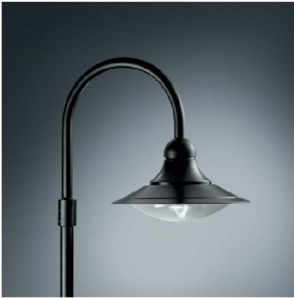
Luminaire classification according to CIE: 98 CIE flux code: 37 70 94 98 80