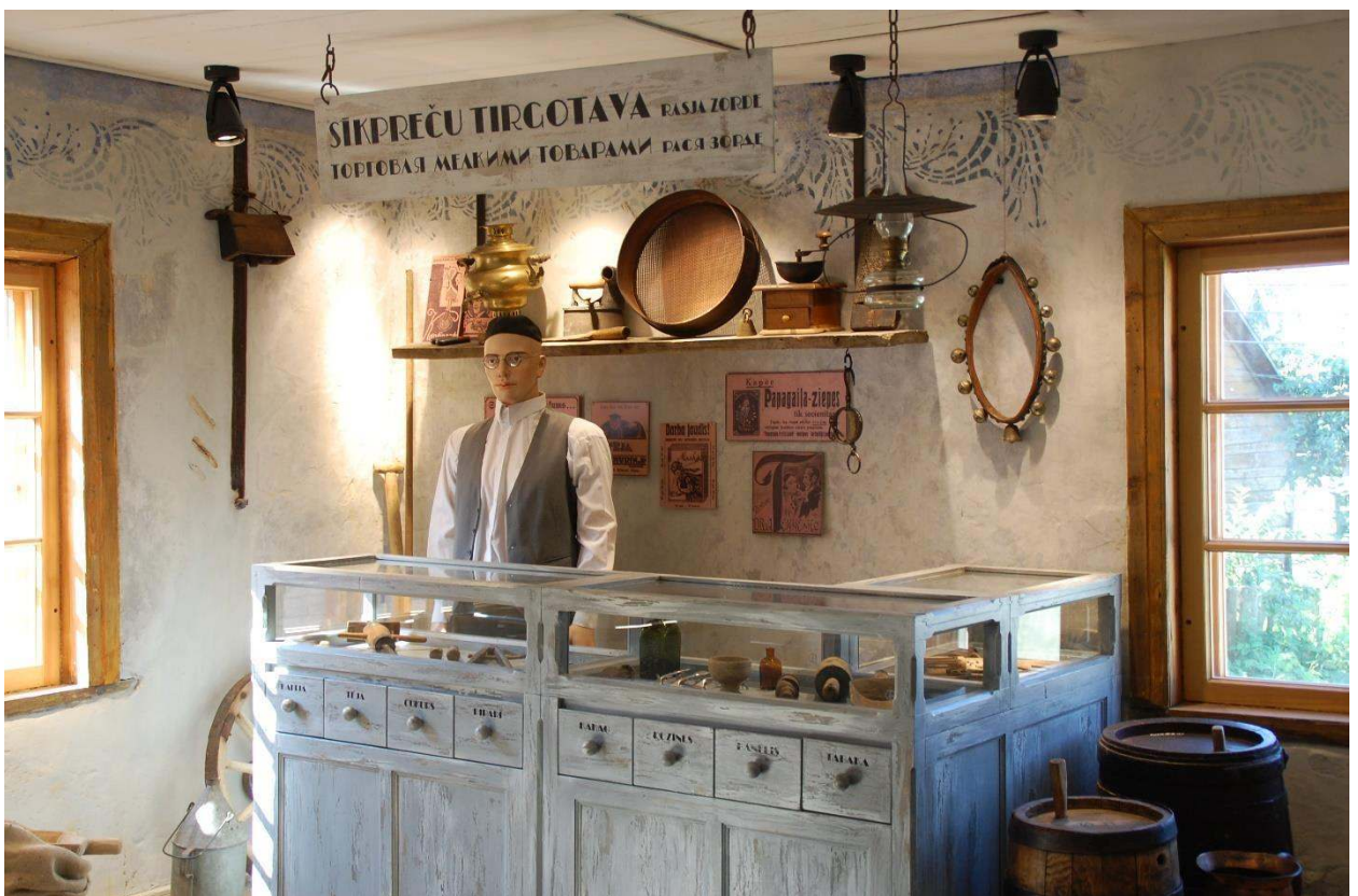
Photo: Exposition “Hasya Zorde’s convenience store” on the first floor

When visitors climb the first floor, they will get inside Jewish shop “Hasya Zorde’s convenience store”. Authors of the exposition are Gunta and Andris Misāns, who made this exposition fitting the synagogue’s style as much as possible, creating authentic atmosphere.