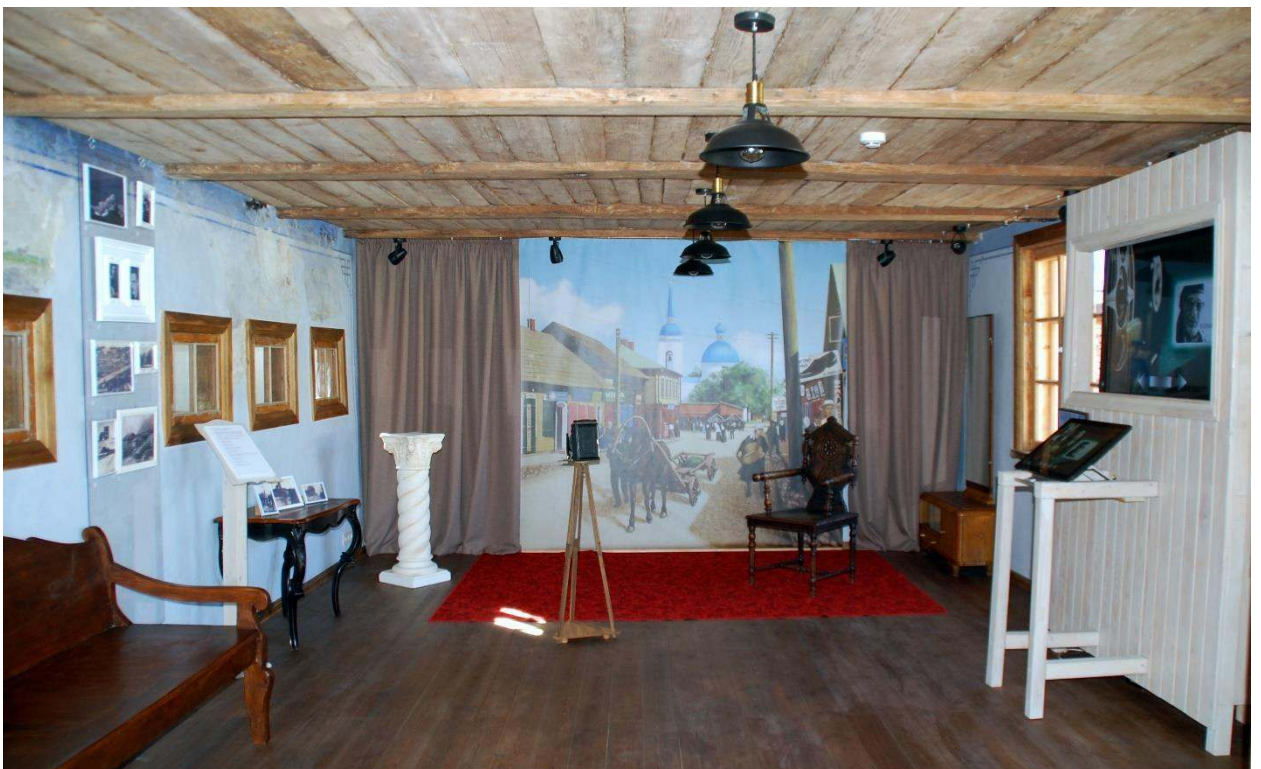
Photo: An exposition on the ground floor