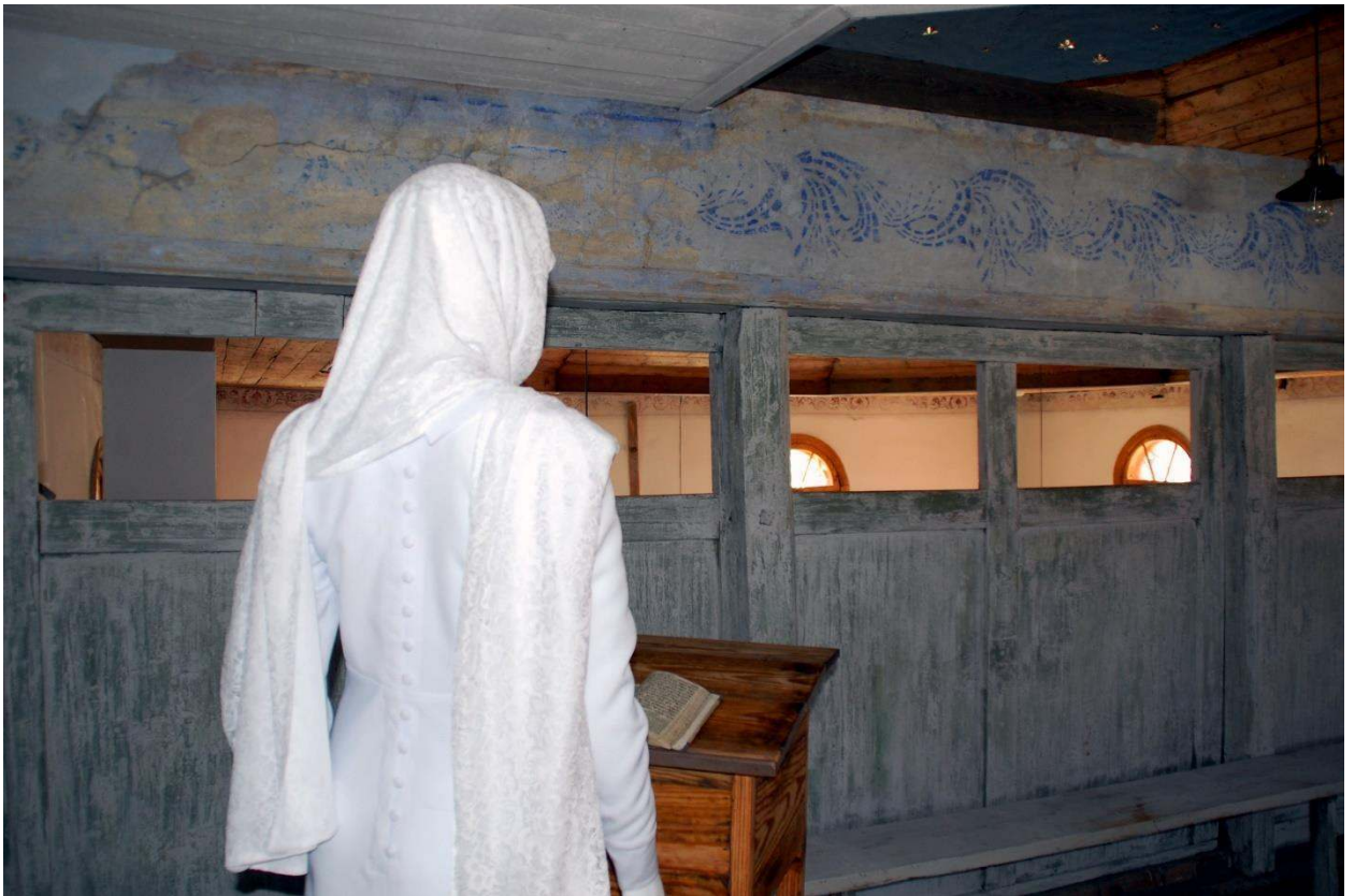
Photo: A part of the exposition on the first floor

The restored synagogue will be a branch of Ludza Museum. The Museum created four different expositions showing history, religion and culture of Jewish people who used to live in Ludza.