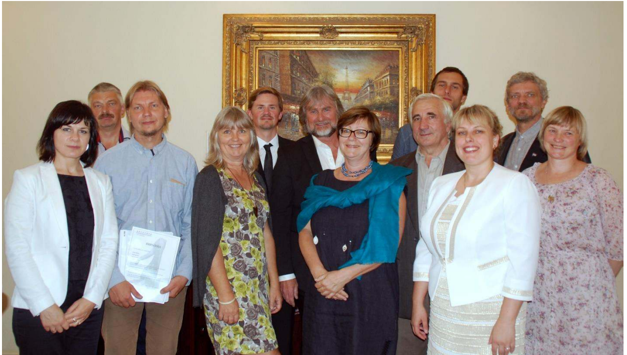
Photo: Project participants and partners from the Museum Centre in Hordaland

Since 1990s the synagogue has not been used, the situation sharply worsened and in 2013 the building was in crucial condition, the interior was demolished, and there was a collapse risk. In 2014 in order to preserve the cultural and historical heritage and to ensure access to qualitative culture services for the society Ludza Municipality launched project "Restoration of Ludza Great Synagogue and Revival of Jews Spiritual Heritage". Its principal activities were restoration of the synagogue, creation of expositions, trainings and experience exchange for Latvian craftsmen in cooperation with project partners – the Museum Centre in Hordaland (Norway).