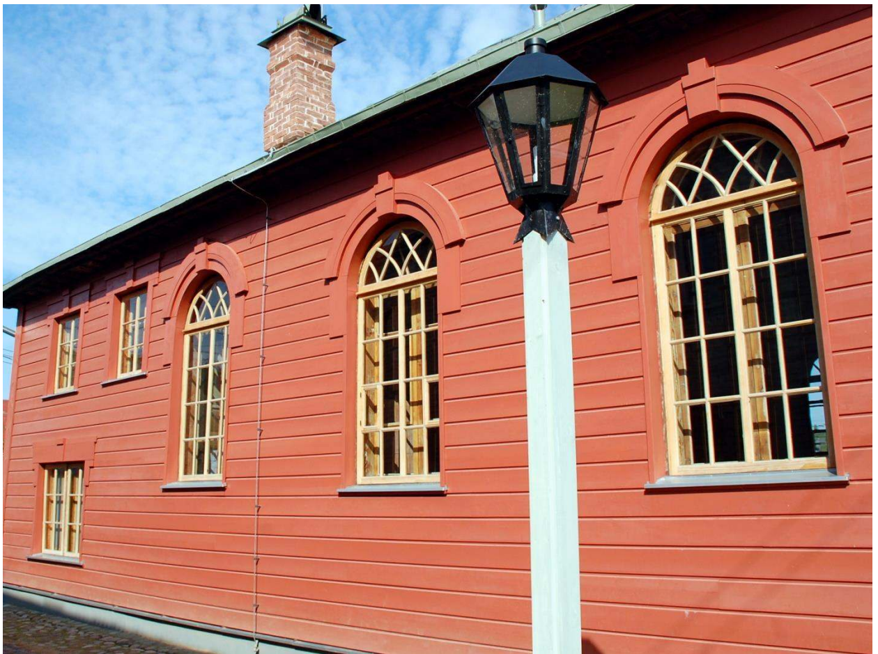
Photo: The restored synagogue